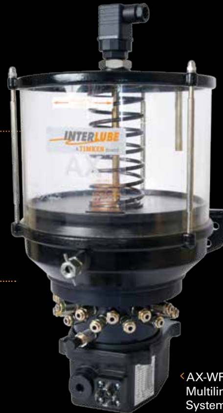
< AX-WF Multiline System